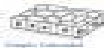
Simple Cuboidal Epithelium