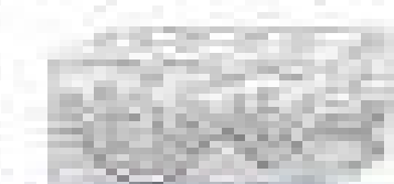
Simple Squamous Epithelium

Identify each type of epithelial tissue and its function. (You may use the following as a guide.)