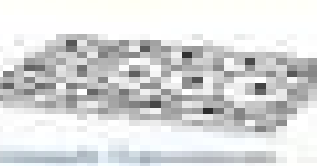
Simple Transitional Epithelium

What is the function of the epithelial tissue? (You may use the following as a guide.)