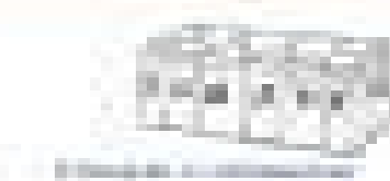
Simple Columnar Epithelium