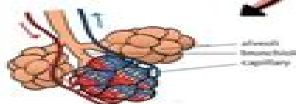
A diagram showing several alveoli and the capillaries supplying them with blood.

The walls of the alveoli separating the air from the blood are very thin allowing gases to diffuse quickly. The blood supply to the alveoli is very good to constantly supply blood with little oxygen and a lot of carbon dioxide keeping a high concentration gradient. The walls of the alveoli are kept moist to allow gases to dissolve into the fluid for gas exchange with the blood.