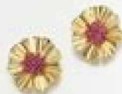
1890-1900 Gold and diamond brooch, New York, 1890s.

This brooch is made of gold and diamond.