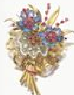
1890-1900 Gold and diamond brooch, New York, 1890s.

This brooch is made of gold and diamond.