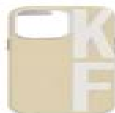
15. LEATHER PHONE CASE