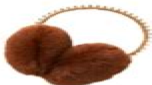
11. CRYSTAL EARMUFFS