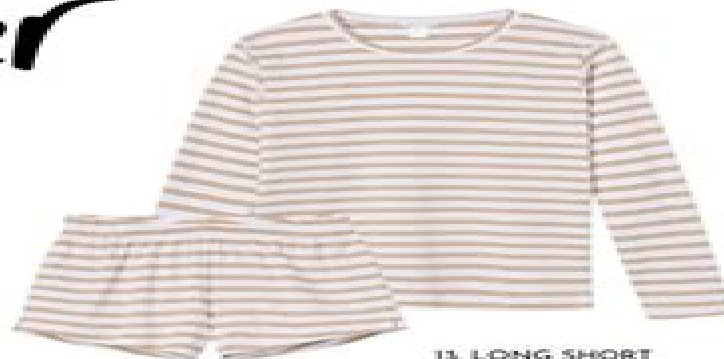
13. LONG SHORT PAJAMA SET