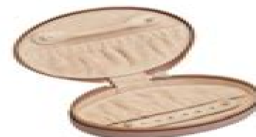
8. TRAVEL JEWELRY CASE