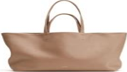
1. CUYANA EASY TOTE