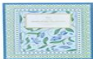
9. 2023 MONTHLY PLANNER