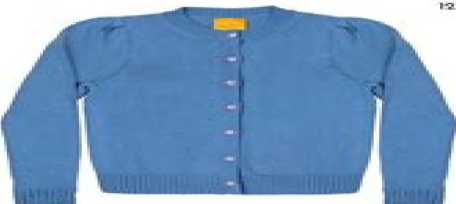
14. PUFF SLEEVE CARDIGAN