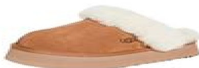
6. UGG SHEARLING SLIPPERS