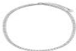
2. DIAMOND TENNIS NECKLACE