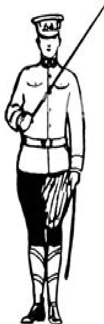
Carry at Double Time