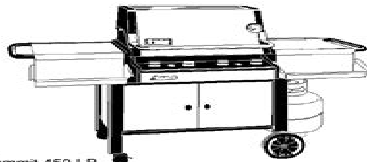
Summit 450 LP