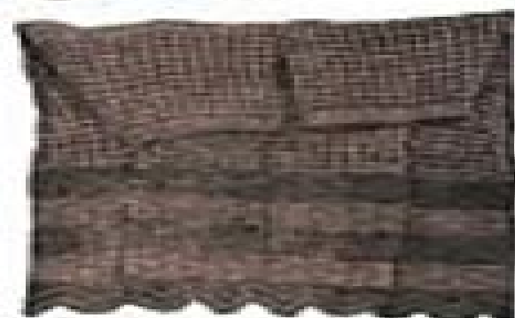
Lady's Petticoat in Basket Pattern