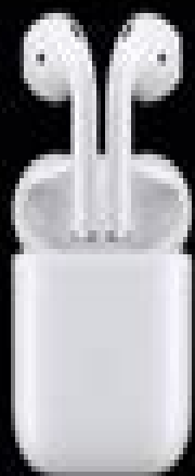
AirPods 2nd Generation