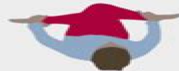
RECLINING COW FACE