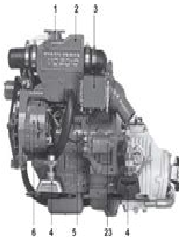
MD2010A/B & M32L