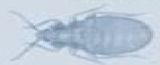
5TH INSTAR STAGE