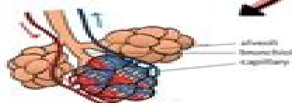
A diagram showing several alveoli and the capillaries supplying them with blood.

The walls of the alveoli separating the air from the blood are very thin allowing gases to diffuse quickly. The blood supply to the alveoli is very good to constantly supply blood with little oxygen and a lot of carbon dioxide keeping a high concentration gradient. The walls of the alveoli are kept moist to allow gases to dissolve into the fluid for gas exchange with the blood.