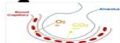
A diagram showing a single alveolus with the oxygen going into the blood and Carbon Dioxide leaving the blood.