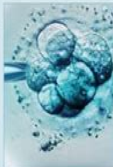
FIGURE 1 The electron micrograph shows a neural network in the third stage (blastocyst) stage cell, sitting on the top of a cell. The nucleus of each cell contains the genetic information that will give rise to the embryonic nervous system and other parts of the body.

The developing brain is especially sensitive to environmental factors at all stages of development. These could be in the environment of the world, where the children and fetus can be exposed to fluctuations in maternal nutrition or temperature, or back again to alcohol, stress, or methylmercury in a complex array of factors that are important during the after-birth (postnatal) sensitive support, social experience, and intellectual stimulation.