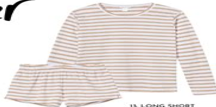
13. LONG SHORT PAJAMA SET