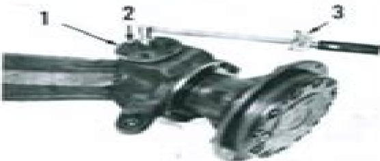
Fig. 8—Install special plate ACTP-3080 (1) on upper king pin, then use a torque wrench (3) to measure torque required to turn planetary unit. Install shims on lower king pin only to adjust king pin bearing preload.

Refill final drive housing and axle housing to correct levels with Allis-Chalmers Power Fluid 821 or equivalent.