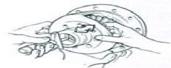
Fig. 10—Use a depth micrometer to measure distance from edge of case to end of side gear to determine thickness of thrust washer required to provide proper end clearance. Refer to text.

Install differential support housing into axle housing and tighten mounting cap screws to 83 ft.-lbs. (113 N·m) torque. Reinstall axle shafts and final drive units. Reinstall axle assembly under tractor. Refill axle housing and final drive housings to correct levels with Allis-Chalmers Power Fluid 821 or equivalent.