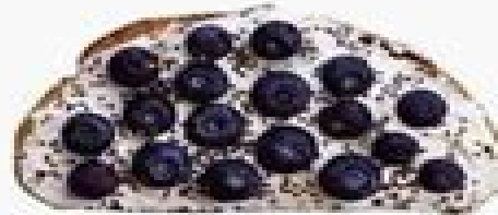
blueberries, greek yogurt & chia seeds