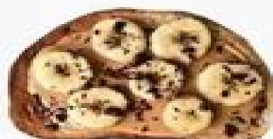
peanut butter, banana & shaved chocolate