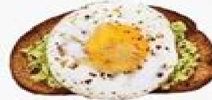
avocado, egg & chili flakes