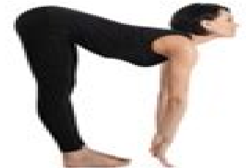
Standing Half Forward Bend