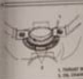
1. CRANKSHAFT BLOCK 2. BEARING