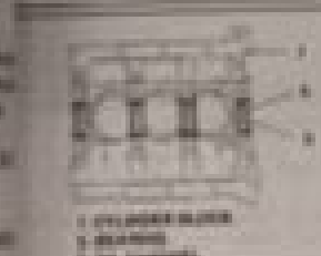
1. CRANKSHAFT BLOCK 2. BEARING 3. OIL TIGHTEN