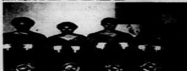
CHILDREN'S CHURCH: The Handbell Choir, St. Mary's Church, is practicing for their performance at the library on Saturday.