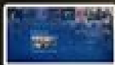
Trabaja con Windows Media Center