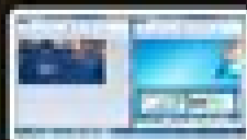
Trabaja en la nube con OneDrive