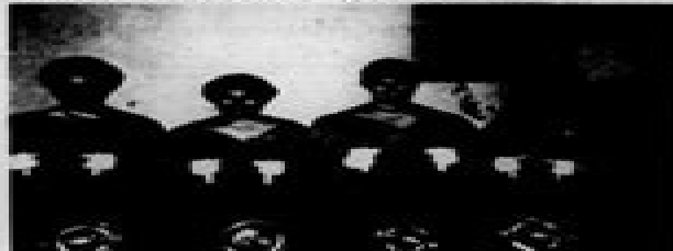
MINNEAPOLIS PUPPET THEATRE: Children perform on the stage of the First United Methodist Church, 1000 Hennepin Ave., in Minneapolis, Minn., for a puppet show.