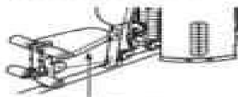
Serial Number Decal (under seat)

Write the serial number in the space above for reference.