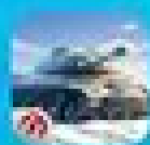
World of Tanks