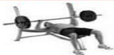
Flat Bench Press