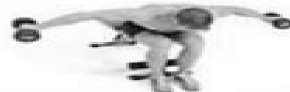
Rear Delt Fly