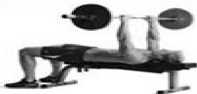
Flat Barbell Bench Press