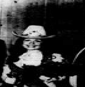
Miss Rodeo America, who is the reigning champion of the rodeo, arrived in Stephenville, Texas, on September 1, 1976.

Throughout the year, "I Think Stephenville is a nice town, a nice place to live," said the Miss Rodeo America, who is the reigning champion of the rodeo.