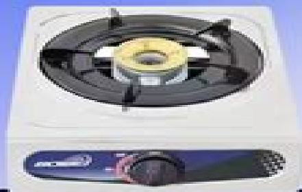
Single Burner Gas Cooker