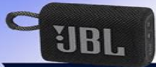
JBL Go 3 MINI Speaker