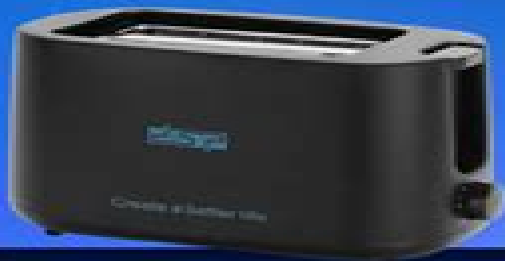
Sandwich Pop-Up Toaster