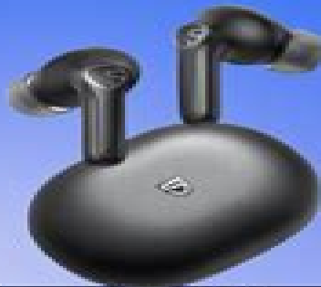
Sound Peat T3 Pro Earbuds