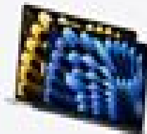
MacBook Air with M2 chip