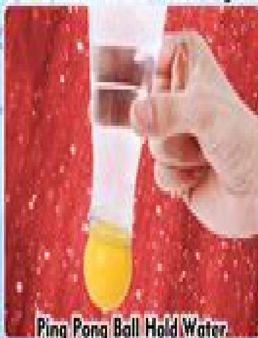
Ping Pong Ball Hold Water