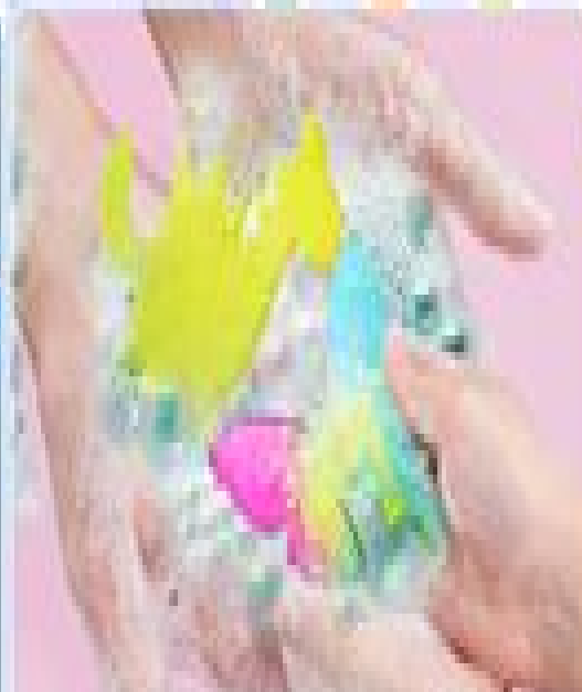
Make Colorful Soaps