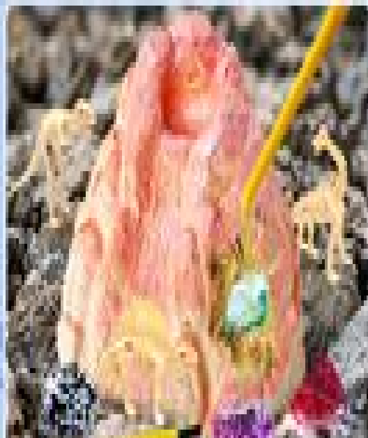
Gemstones & Dinosaur Dig