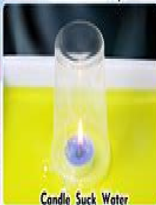
Candle Suck Water