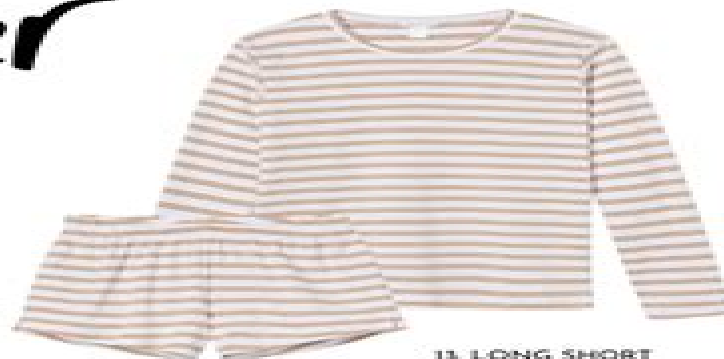
13. LONG SHORT PAJAMA SET