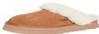
6. UGG SHEARLING SLIPPERS