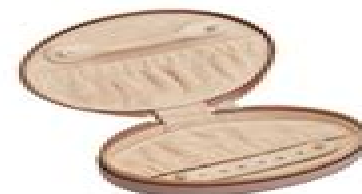
8. TRAVEL JEWELRY CASE