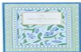
9. 2023 MONTHLY PLANNER