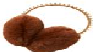
11. CRYSTAL EARMUFFS