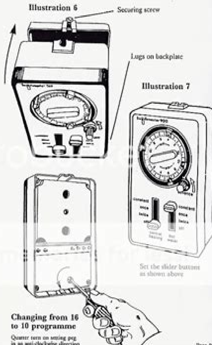
Changing from 16 to 10 programme

Quarter turn on setting peg in an anti-clockwise direction