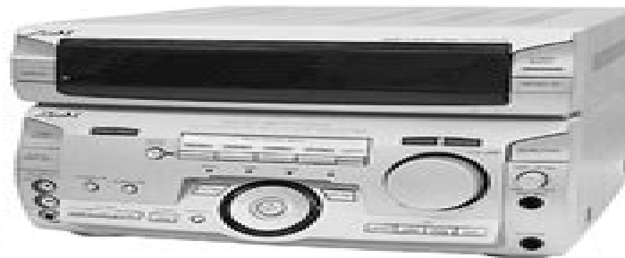
STR-W770 is RECEIVER section in MHC-W770AV.