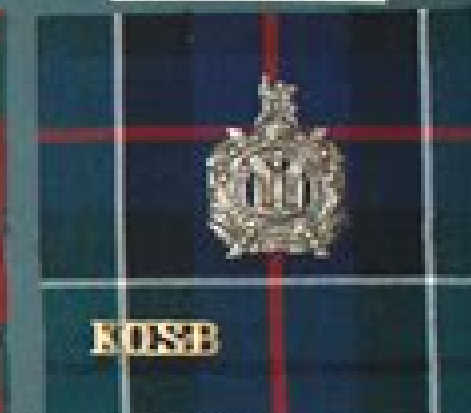
THE ROYAL SCOTS BORDERERS (2nd Regiment of Foot)