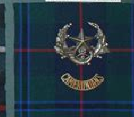
THE CAMERON HIGHLANDERS (49th Regiment of Foot)