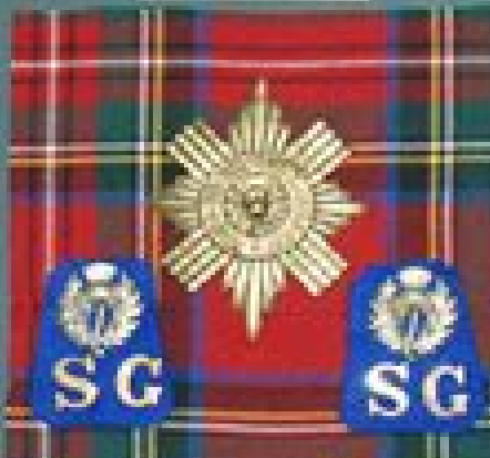
THE SEAFORTH HIGHLANDERS (53rd Regiment of Foot)