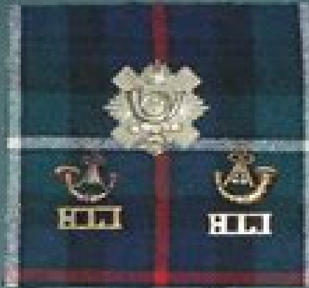
THE HIGHLAND LIGHT INFANTRY (51st and 52nd Regiments of Foot)