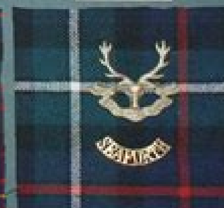
THE SEAFORTH HIGHLANDERS (53rd Regiment of Foot)