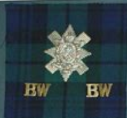
THE BLACK WATCH (7th, 9th and 13th Regiments of Foot)