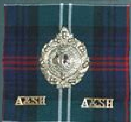
THE ARGYLL AND SUTHERLAND HIGHLANDERS (25th Regiment of Foot)