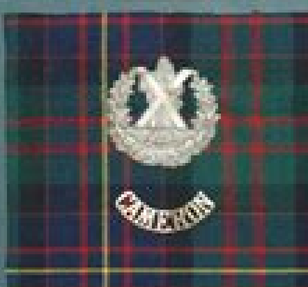
THE CAMERON HIGHLANDERS (49th Regiment of Foot)