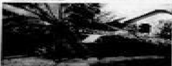
Storm clouds over the Gulf of Mexico.