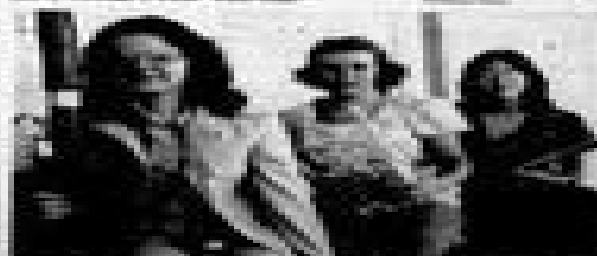
Three young women from the Ingleside High School band.

The school board is committed to providing excellent service to its students and is looking forward to a successful future.