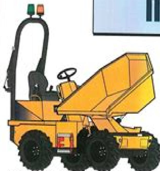
Mach 2077 - 2.5 Tonne Powerswivel