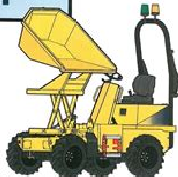
Mach 2071 - 2.0 Tonne Hi Swivel