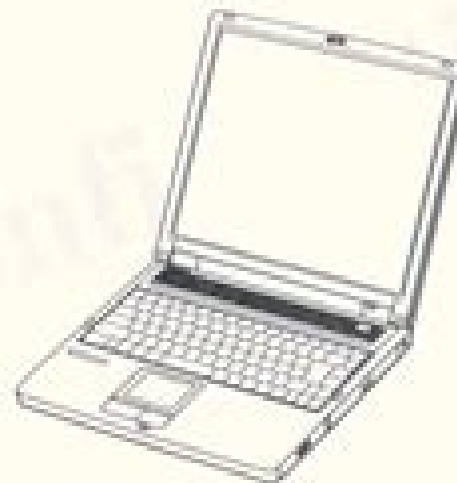
Unit : PCG-FR77G