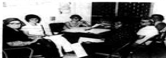
FROM THE FINAL PREPARATIONS —The Clarksville Community Center students are preparing for their performance in the Clarksville Community Center. The students are preparing for their performance in the Clarksville Community Center. The students are preparing for their performance in the Clarksville Community Center.