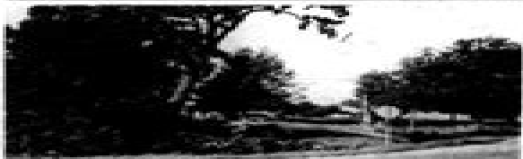
THE WINDMILL LIGHT —The Clarksville Community Center is now in full swing for the 1977 fair events. The center is open from 9 a.m. to 5 p.m. daily. The center is open from 9 a.m. to 5 p.m. daily. The center is open from 9 a.m. to 5 p.m. daily.

The Red Kap Open House is being held on Sunday, September 24, from 10 a.m. to 5 p.m. The open house is being held at the Clarksville Community Center. The open house is being held at the Clarksville Community Center. The open house is being held at the Clarksville Community Center.