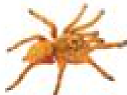
Orange Baboon Tarantula