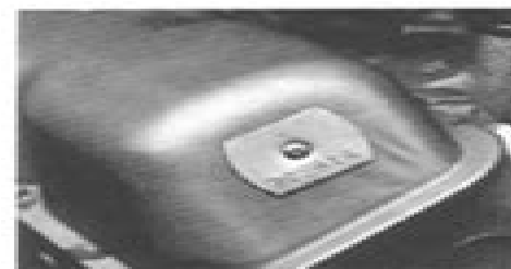
FIGURE 1 — Engine Code Location