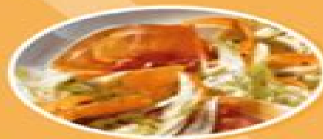
Rezepte zum Abnehmen