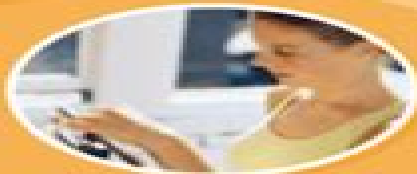
Das richtige Gewicht