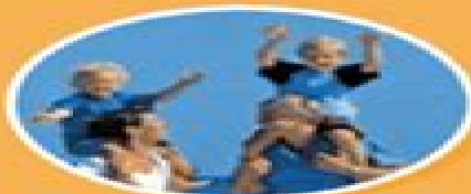
Der Weg zum Wohlfühlgewicht